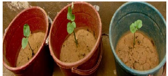
Fig. 6. Jatropha seedlings during Nursery Stage (replicates watered with simulated water of high oil concentration and medium NaCl concentration)

Table 3 shows the result of Mauchly's sphericity test for each of the three effects in the model (two main effects and one interaction). The significance values ( p < 0.05 ) of these tests shows that for the main effects of oil, salt and oil/salt