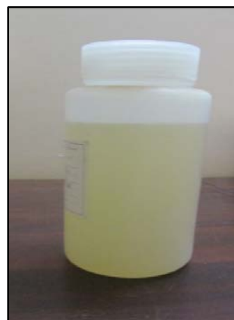
Fig 1. Locally obtained produced water sample