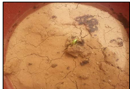
Fig. 5. Jatropha seedling