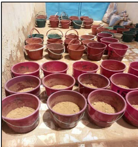
Fig. 3. Experimental setup

The factors accommodated were; the amount of crude oil in the Simulated Produced Water in ppm (40–2,000 ppm) [3], and the amount of NaCl salt in the irrigation water (2.152–5.380 ppm) [7].