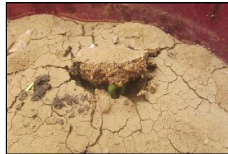
Fig. 4. Germination process