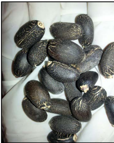
Fig. 2. Jatropha seeds

Jatropha fruits were obtained from Blue Nile state, which lay (490 km) distant, south east of Khartoum, capital of Sudan. The fruits were husked manually as shown in Fig. 2 . Virgin soil was brought from a farm located in west Omdurman, Khartoum state, a regime affected by desertification; in order to simulate the conditions of the remote areas, where the petroleum facilities that generate produced water lay. The Jatropha was propagated by seeds, and before sowing them, they were overnight soaked in water for 24 hours, to improve the germination percentage. The seeds were subsequently sown in 75 polyethylene buckets 30 cm in diameter filled with soil to an average depth of 15 cm. The experiment was conducted during April-May 2014, and the seeds were sown in the buckets in Thursday, the 17th of April, after watering the seed beds sparingly and soils were kept loose to prevent cracking. A factorial experiment was organized (see Figure 3), in which treatments consist of combinations of five levels for two factors i.e.; a design of 5 crude oil concentrations \times 5 NaCl concentrations and 3 replicates were used.